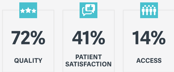
PERCENTAGE OF ORGANIZATIONS